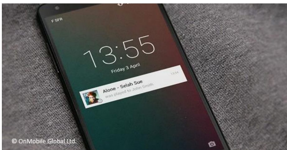
See what's playing with real-time notifications

In practice, this makes it possible to display the song that is being played when the phone is ringing. Soon, this will also allow the callee to change the Ringback Tone and put an audio status such as “I am in a meeting” or “I am driving” with a simple click. More than a music service, it becomes a rich communication tool.