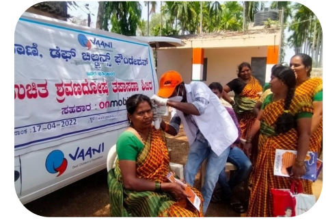
Community ear Check-up camp

We supported Newborn Screening, Early Intervention, Capability Building and Training of Community members under Outreach all of which were hugely successful interventions.