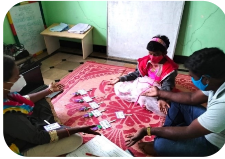
Session at Sadhan center