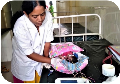
New born Screening