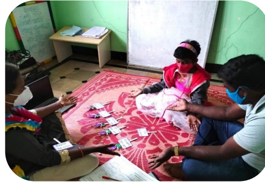
Session at Sadhan center