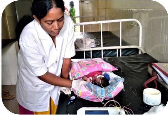
New born Screening