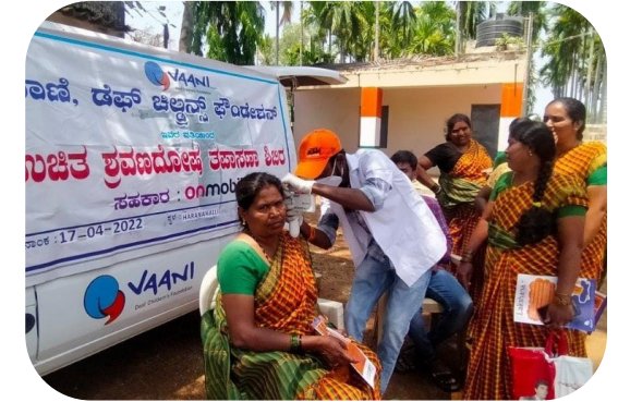
Community ear Check-up camp

We supported Newborn Screening, Early Intervention, Capability Building and Training of Community members under Outreach all of which were hugely successful interventions.